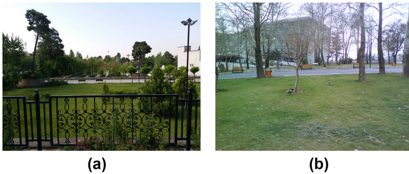
Fig. 1. Typical public greenery spaces in Tehran. Left: This land lot in district D7 is a repurposed infamous old prison; Right: A well-known old park, Park Mellat, located in district D3; the building shown in the photo is a multi-purpose building added to the park a few years ago

(D8, D9, D10, D12, D14, D15, D16, D17, D18). Typically, these districts encompass impoverished neighborhoods with less favorable economic, environmental, and social conditions such as residents' literacy, population density, greenery spaces, and daily travels. Research reveals that such districts have a density of over 300 persons per hectare as the densest area in Tehran (Ghadami & Newman, 2017). A few of these districts host the most significant concentration of old shopping markets and educational centers in Tehran. However, most of these properties may be owned by the affluent people who live in high-quality districts or are regarded as public and cultural assets with no hope of being demolished or refurbished. Therefore, these dense districts are covered less by greenery spaces and a few new-built developments.