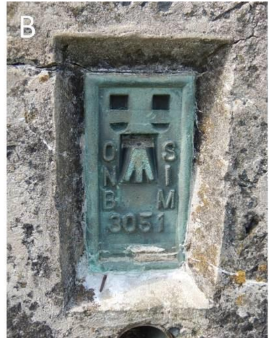
A. Scudion Craig trig pillar. B. Flush bracket on Scudion Craig trig pillar.

Bench marks and most trig pillars are no longer maintained by OSNI. Surveying and map making have gone digital and computers can do in seconds what previously took several man-days. As a consequence bench marks are no longer being inscribed and the existing crop is slowly and inexorably being lost as re-development occurs. Perhaps some form of legal protection should be applied so that in the years ahead we will still be able to find and see the 'Marks of the Ordnance Survey'.