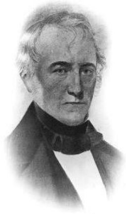
Colonel Thomas Colby, 1784 - 1852.

Following the division of Ireland in 1921 separate OS organisations emerged. The original body was now confined to Great Britain with HQ in Southampton. The OS of Northern Ireland (OSNI) was established on 1 st January 1922 with HQ in Belfast, and in the Irish Free State the OS came into being on 1 st April 1922 with HQ in Dublin. Irrespective of the breakup, each body continued to “provide and maintain a network of mapping of the highest possible quality on a national basis”.