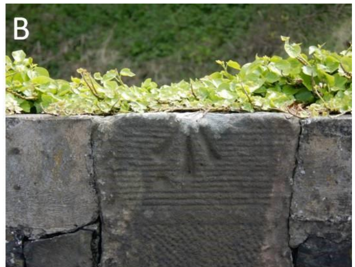
A. Long Gilbert Bridge: bench mark at base of sandstone block on south-facing parapet. B. Long Gilbert Bridge: bench mark arrow at top of sandstone block on north-facing parapet.

In 1950 the OSNI commenced work on a re-triangulation of the province in order to provide a basis for a new series of large-scale maps. A consequence of this was the construction of triangulation stations – generally known as trig pillars or trig points – on many hill-tops. These take the form of a truncated concrete pyramid about 1.2 m high and 0.6 m square at the base. Fixed to the top of each pillar is a brass ‘spider’ with three legs 120° apart upon which a theodolite can be mounted for surveying purposes. On one side of the pillar a rectangular metal plate called a flush bracket (‘flush’ with the face of the pillar) is normally present. The flush bracket carries a bench mark. Flush brackets were sometimes placed on walls and buildings but I do not know of any such in Portrush. Perhaps the nearest example is Coleraine Town Hall, although some years ago an electricity box was placed against the wall, effectively obscuring the bracket!