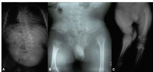
Fig. 1 (A) Radiological examination showed a dorsolumbar scoliosis. (B) The ilia were broad and short in their vertical dimension. The proximal femoral epiphyses were in severe varus position and mottled in appearance. (C) The right knee was in valgus position, the left mildly bowed. The metaphyseal margins of the long bones were irregular with intermingled radiolucencies and radiodensities.

We identified two variants, one clearly pathogenic and second potentially pathogenic in COL2A1 gene, c.3275G > A; p.G1092D in exon 47 and c.1366–13C > A in intron 21.