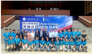
( https://www.ulster.ac.uk/insight/news/2019/07/ulster-college-open-day-at-shanxi-university-of-science-and-technology/ )