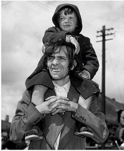
This Was England