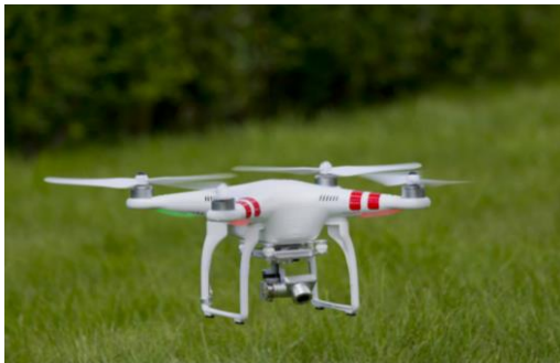
Figure 2 – Rotorcraft UAV

Fixed wing UAVs, as shown in Figure 3, fly like a traditional aeroplane as they use wings rather than rotors in order to generate their lift. This method is far more efficient and as a result they can travel faster for longer; this makes them the ideal choice for survey sites of a large area. Difficulties associated with fixed wing are the launching procedures as this requires some form of runway and its inability to maintain one position to gather detailed data of a specific area. With the popularity surrounding UAVs in industry and their increasing use in construction, the focus begins to fall on what method can be utilised to capture data using these vehicles (Buczowski, 2018).