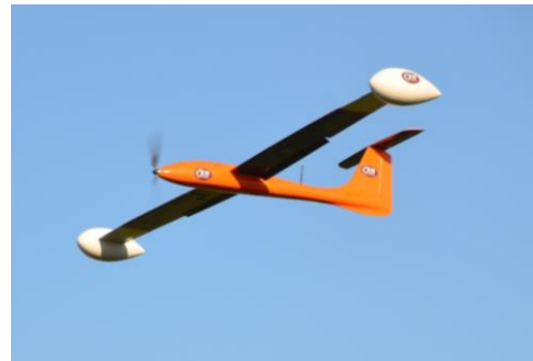
Figure 3 – Fixed Wing UAV