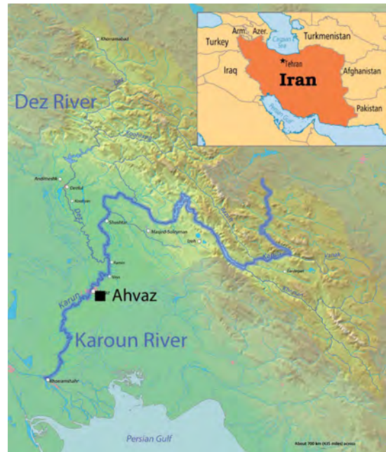
Figure 1: Map of the Dez and Karoun rivers system.

connected to the main reservoirs (i.e., Dez, Karoun, and Masjed Soleyman) account for 20% of the national hydropower generation capacity. Dez dam located on the Dez River has a storage capacity of 945 \text{ Mm}^3 and the power generation capacity is 520 MW. Karoun and Masjed Soleyman dams, located on the Karoun River, have a capacity of 824 \text{ Mm}^3 and 261 \text{ Mm}^3 , respectively. The power generation capacity of both the power plants connected to Karoun and Masjed Soleyman dams is 2000 MW.