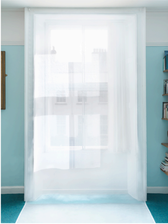
The Light Beautiful (I) 21 Westland Row Dublin 2014 (Place of Oscar Wilde's Birth)