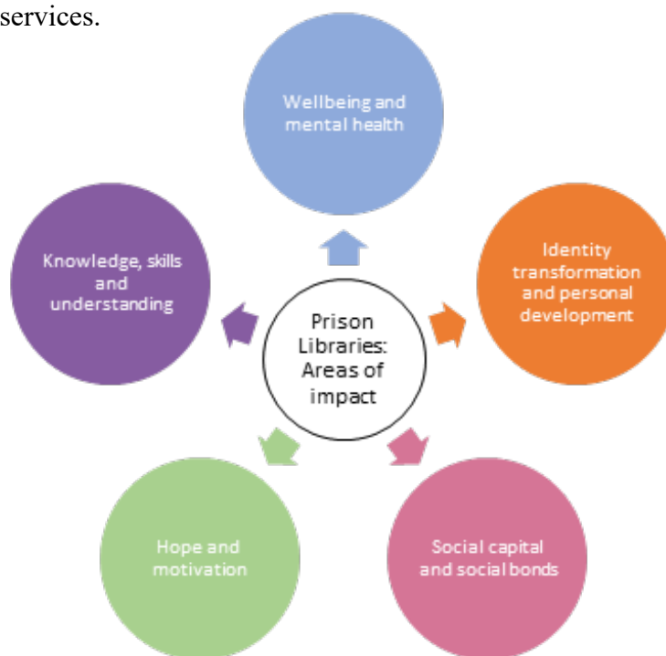
Figure 3. Areas of Impact of Prison Libraries (Prison Library Impact Framework, Finlay, 2018)