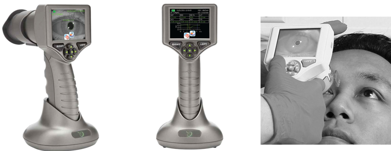
Figure 1. PLR device and data display.