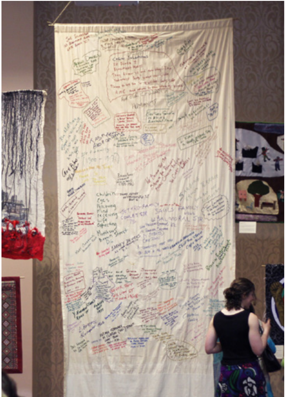
Figure 5. Exhibition 'Textile Accounts of Conflicts' as part of their International Conference 'Accounts of the Conflict: Digitally Archiving Stories for Peacebuilding', Hosted by INCORE (Ulster University).