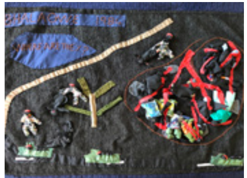
Figure 6. Who is down the mine shaft? Bhalagwe 1984. Zimbabwean arpillerera, Enyandeni Women's Textile Art Group (2019). Enyandeni Peace Centre collection: https://cain.ulster.ac.uk/conflicttextiles/search-quilts2/fulltextiles1/?id=427

The first known textile to travel to Northern Ireland was not from Chile but Peru. The Peruvian textile, titled 'Asociación Kuyanakuy, Ayer – Hoy' was brought to Northern Ireland in 2008 by author Bacic and transported by Hamber, for an art exhibition entitled 'Art of Survival: International and Irish Quilts' (see https://cain.ulster.ac.uk/conflicttextiles/search-quilts2/fullevent1/?id=70 ). The exhibition was hosted by The Derry City Council Heritage and Museum Services in the Tower Museum and eight other venues in the City of Derry. The Peruvian piece, made by displaced Indigenous women, embodied the idea of textiles as a political language. It was used as 'testimony' by a group of women to the Truth Commission in Peru.