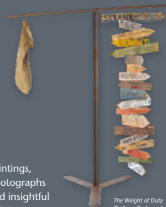
The Weight of Duty © Anna Redwood

Paint supplied by ZOFFANY stylelibrary.com/zoffany PAINT