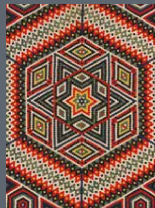
The Brayley Quilt

An important glimpse into the humanity that lies beneath the horrors of war.