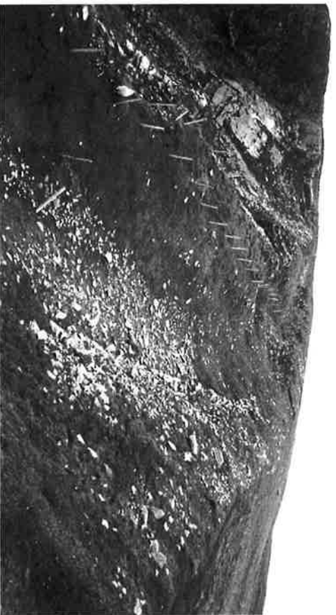
Fig. 7.6. This linear depression on the cliff-top north of Skelpoonagh Bay indicates outward and downward movement of the cliff; it represents the top of an arrested slide mass.

The third area of RSF lies on the cliff-top north of Skelpoonagh Bay in the vicinity of the Signal Tower (my notes from several years ago do not include a grid reference!). A failed mass of rock is evidenced by the shallow linear trench running parallel to the cliff-top (Fig. 7.6). The trench is bounded by a rock parapet on its seaward side and by a bedrock scarp on its landward side that is, in part, covered by vegetation and boulders. As with the cliff-top failures mentioned above, this feature is testimony to an earlier episode of large-scale rock-slope instability.