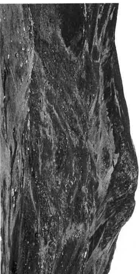
Fig. 7.4. The debris mounds of a sub-cataclastic rock avalanche below Craibeefan, to the east of Skelpoonagh Bay, Glencolmcille.

At least three areas of RSF have been seen in the vicinity of Glencolmcille. One of these is east of Skelpoonagh Bay, on the western flank of Craibeefan (grid reference 524 863). The debris is disposed as a series of large mounds with many surface boulders (Fig. 7.4). Some debris mounds sit directly below the col connecting Beefan Mountain and the unnamed summit to the west with a Signal Tower. Failure morphology suggests an arrested slide / sub-cataclastic rock avalanche.