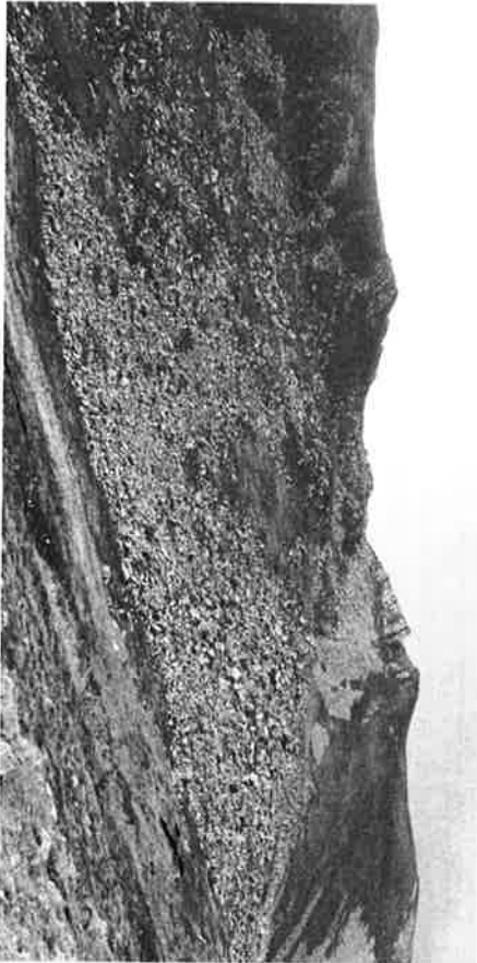
Fig. 7.3. Looking up the debris lobe of the Slieve League slide / rock avalanche shown in Figure 1. The failure extends downslope from the ridge crest, which has been lowered as a consequence. Three boulders from near the toe of the lobe have given cosmogenic nuclide ( ^{10}\text{Be} ) surface exposure ages of ~17 ka.

Another area of failure on Slieve League is crossed when taking the footpath that leaves the cliff-top car park at Bunglass and heads towards the summit. Within a few hundred metres, around grid reference 564 760, the path passes through an area of fractured crags, low ridges and depressions, holes and fissures. The full extent of this