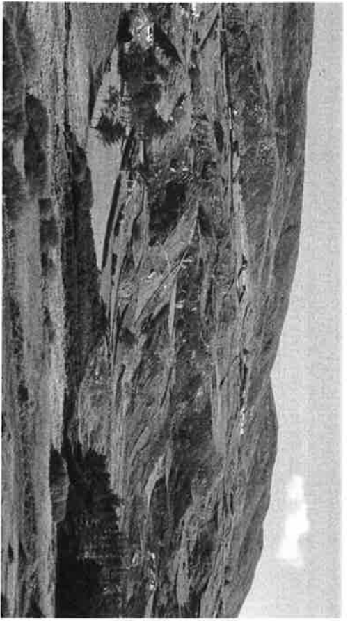
Fig. 7.5. Large-scale arrested rockslide on the hillside to the northwest of Glencolmcille. Failed masses of bedrock extend from near the hillcrest to the valley floor. Steepening of the lower slopes may be because the failed masses came to rest against the flank of the last decaying valley glacier.

The third area of RSF lies on the cliff-top north of Skelpoonagh Bay in the vicinity of the Signal Tower (my notes from several years ago do not include a grid reference!). A failed mass of rock is evidenced by the shallow linear trench running parallel to the cliff-top (Fig. 7.6). The trench is bounded by a rock parapet on its seaward side and by a bedrock scarp on its landward side that is, in part, covered by vegetation and boulders. As with the cliff-top failures mentioned above, this feature is testimony to an earlier episode of large-scale rock-slope instability.