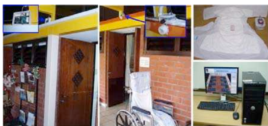
Figure 2. System Deployments in Nursing Home

We decide to conduct a trial in a nursing home after conducting many experiments in the laboratory. As a start, we perform the trial with a suitable single elderly with high continence aid requirements. We hope to continue to tune the system for robustness before we conduct a bigger trial with more elderly. The sensor-signal receiver node was deployed in the vicinity of the patient such as on the bedside or the wheelchair. Two relay/actuator nodes were placed outside the patients' room and near the common dining area respectively. The gateway node was placed outside the nursing station, and the PC with 3D user interface was installed in the nursing station for the caregivers to monitor incontinence status and interact with the system when an incontinence episode occurs. Figure 2 shows the actual deployment in the nursing home.