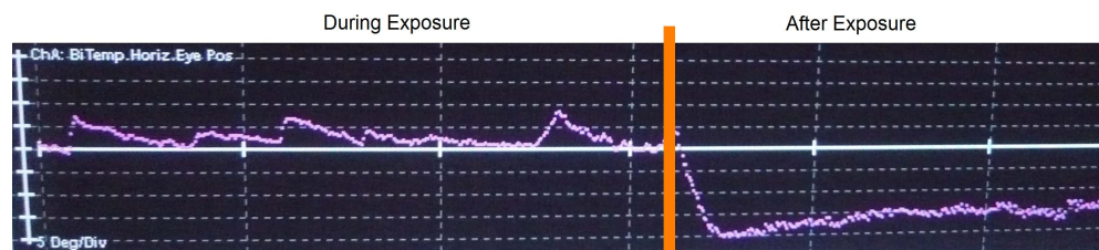
Fig. 3. EOG results during and after exposure to stimulus

Also found during exposure to the stimulus was that optokinetic nystagmus did not occur constantly throughout exposure. It was found that there were occasional brief seconds of eye inactivity throughout, despite a lack of