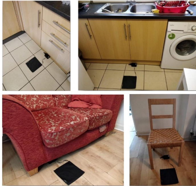
Figure 1. Exercise snacking prototypes for supporting one-leg balance (top) and sit-to-stand (bottom) exercises. Images taken by the researchers to demonstrate potential locations for the prototypes.

The prototypes were accompanied by a booklet explaining exercise snacking and the two selected exercises, with advice on how to do them correctly and suggestions of times and places at home where they could be done. The booklet also included a setup and troubleshooting guide.