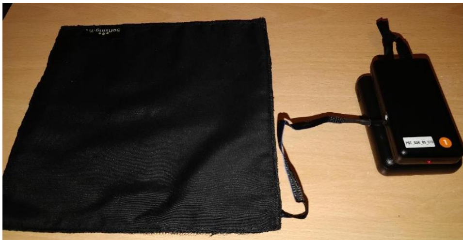
Figure 2. A pressure mat and a battery pack that were used as a basis of the prototypes.

We developed two prototypes. Each consisted of a pressure mat and a battery pack. We used SensingTex Switch mat that enabled a single pressure point recognition (see Figure 2). We selected a pressure mat as the basis of each prototype as it would not require any complex interactions and participants would only need to stand on it if they were ready to exercise. Each mat was connected via Bluetooth to a Raspberry Pi 4 and a Unicorn HAT LED Matrix. The LED screen provided feedback to the user as without it, due to the mat's minimal interface, it was not clear if the prototype was active or whether participants were reaching their goals. The screen also provided encouragement and motivation.