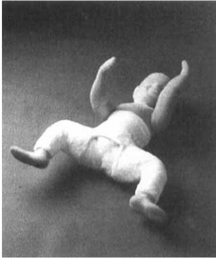
Figure 1 A clothing dummy representing an 18 month old child plastered in a double hip spica plaster splint or 'Lorenz' plaster.