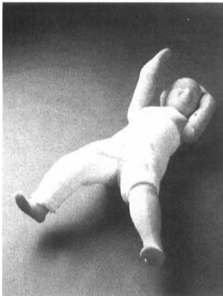
Figure 2 A one-and-a-half hip spica plaster splint with an abduction bar, on a clothing dummy representing a 2-year-old child. (Photograph by Eoin Stephenson).

allow the child some flexibility of movement while still retaining the abducted position that will enable the hip to continue developmental growth. The Denis Browne Harness is the main mechanical splinting device used in Great Britain [5].