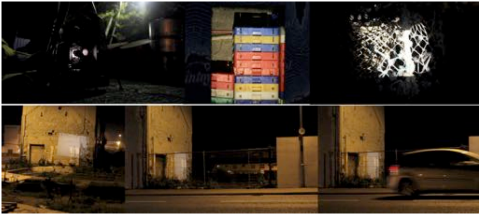
Fig. 04. “Elmo” An MArch student experiment in expanded cinema

The influence of the first stages was an immediate move to experiment and try to apply different techniques without as much perceptible pre-judgement as the first films. One group of students took it upon themselves to purchase a used 8mm projector, immersing themselves in the town over a couple of days. Their example in Figure 04 draws heavily on Raban’s Diagonal , projecting an analog square of light onto selected surfaces that is captured through the digital process.