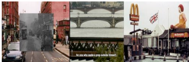
Fig. 01. Film stills from City of the Future and London by Patrick Keiller

Keiller is principally known for a collection of films, The Robinson Series that use an imaginary narrative and narrator to focus on London - on architectural, political, and social trends related to consumerism, conservatism, globalization, and individual identity in urban society. His work, illustrated in Figure 01, combines archival footage with a pseudo-documentary style, what he calls “an attempt at some sort of hyperreality.” 2