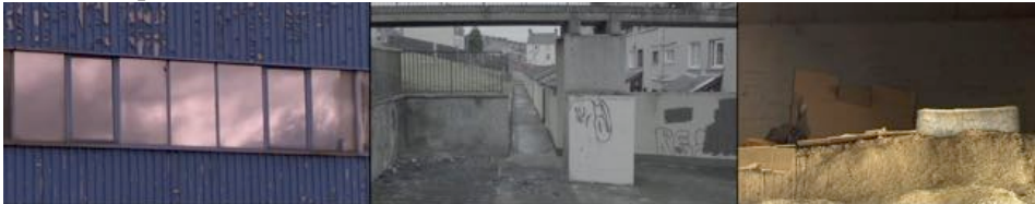
Fig. 03. Film outtakes from Empty , Remains , and Segura by Willie Doherty

Doherty's work, illustrated in Figure 03, varies from landscape to urban settings and often incorporates long focused images, filmic photographs, sometimes with natural sounds, and other with voiceovers, and layers of text and image, "which creates a sense of ambiguity and plays on the viewer's prejudices and assumptions." 5