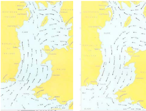
Fig. 3. Tidal flow in and out of the Irish Sea

A review of tidal charts reveals that the Irish Sea fills from both the north and south simultaneously, therefore the total height gained, as measured by onshore tidal range monitors, must have entered from these two channels (high tide). The tide then exits simultaneously through the same two channels resulting in a lower sea level (low tide). This cycle of high and low tide is repeated twice every day due to strongly semidiurnal tidal behaviour in the region with maximum (spring) and minimum (neap) tides occurring on a biweekly cycle.