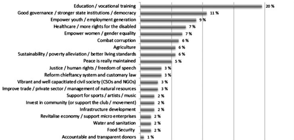
Figure 2. 'Wish list' of all interviewees in Sierra Leone, 2011–12.

spoke to in the street. The random sampling notwithstanding, responses reflect the findings of a countrywide opinion poll conducted by the Freetown-based CEDSA in 2009, which also ranked education as top.