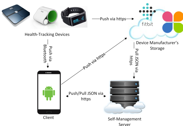
Fig. 1: Overview of the primary system components highlighting the protocols used for communication.

A fundamental workflow within a self-management paradigm is goal setting which enables a patient and a health-care professional to collaboratively choose life-goals, for example 'I would like to walk one mile in 30 minutes within a month'. There are nine main attributes that will be captured to represent each goal as described below. The status denotes the current state of the goal and indicates if the goal is active, cancelled or completed. The goal importance and self-efficacy