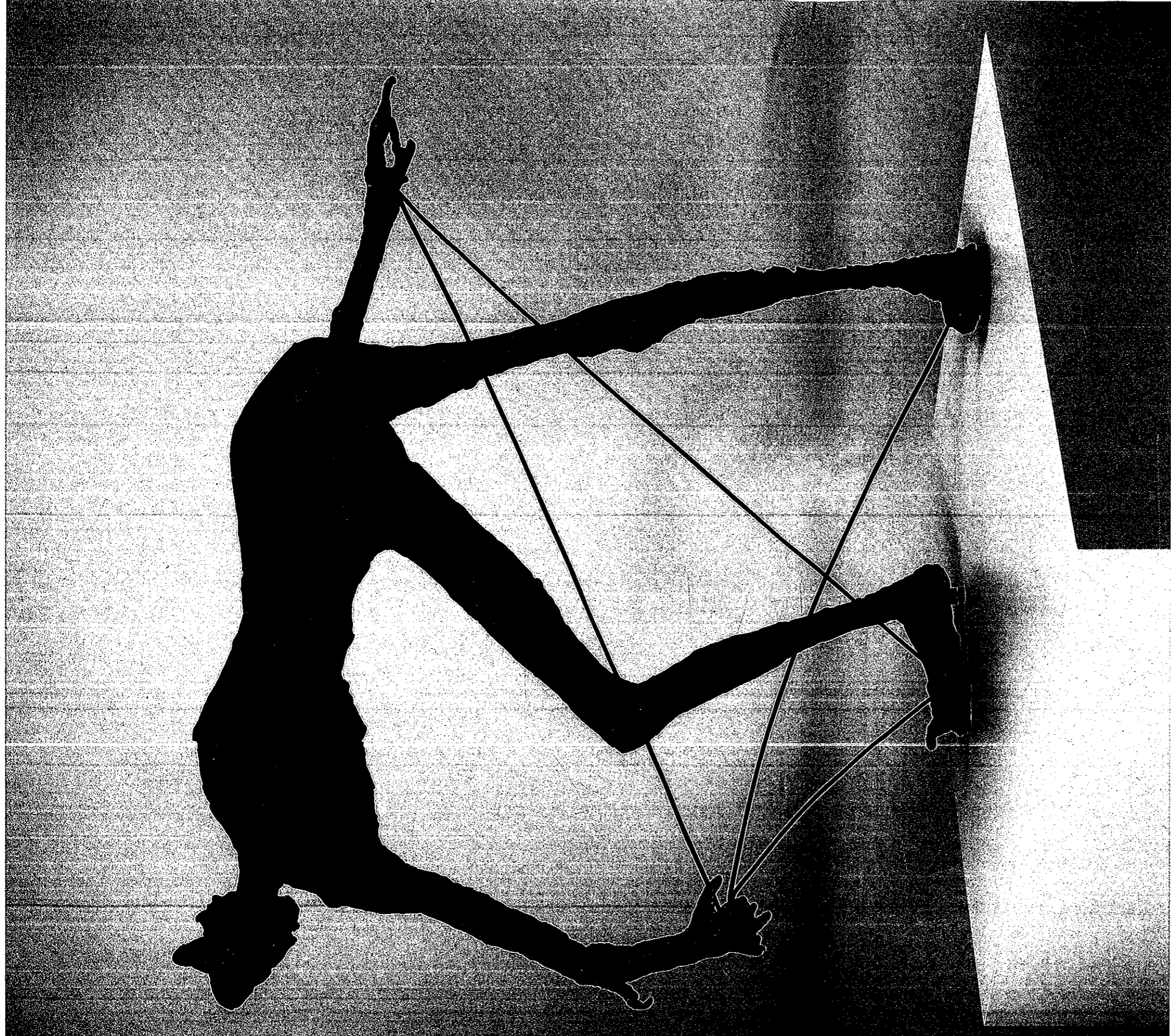
Simone Richier, Le Grifin, 1952. Bronze, 89 x 98 x 85 cm. Museum Ludwig, Cologne