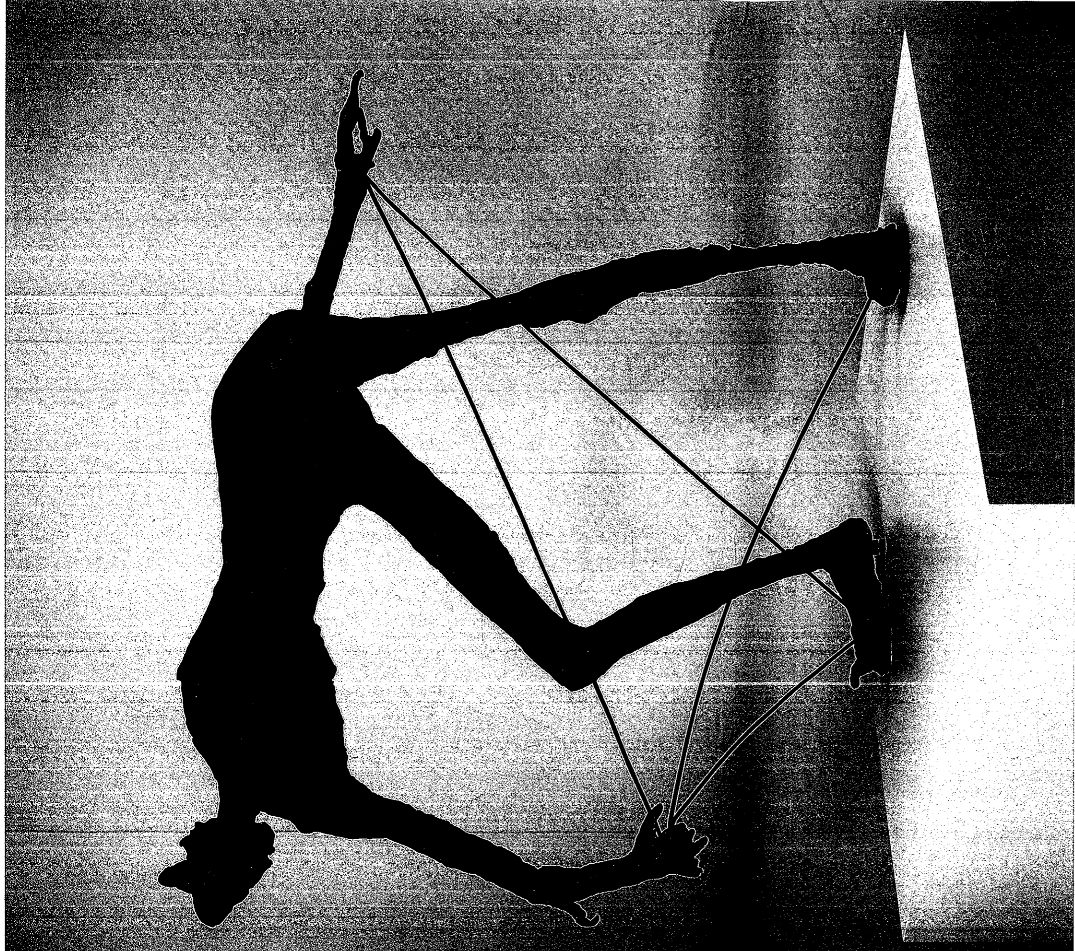
Simone Richier: Le Grégoire, 1952. Bronze, 89 x 98 x 65 cm. Museum Ludwig, Cologne