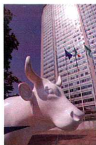
Page 15 / The Italian Job