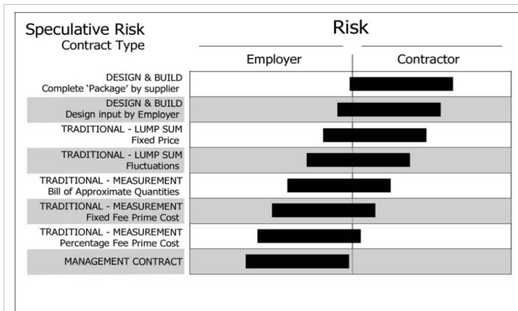
Fig. 1: Risk Apportionment between Client and Contractor