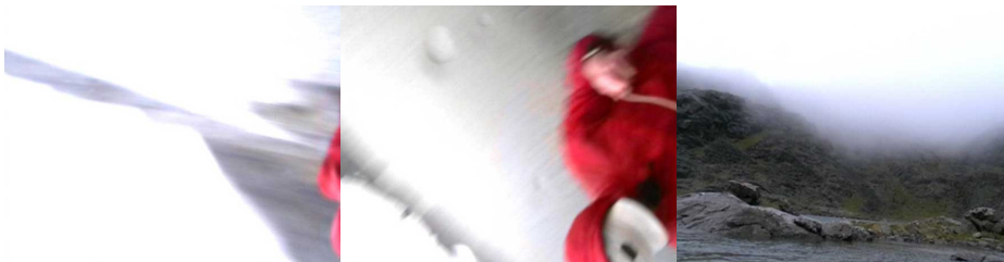
Coir' a' Ghrunnda 360 2007 (1st exhibited 2008) DVD 1.50min