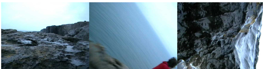
Aillade, Burren 360 2007 (1st exhibited 2009) DVD 1.45min