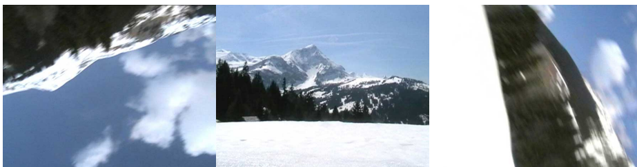
Spitzhorn 360 2005 (1st exhibited 2009) DVD 1.50min