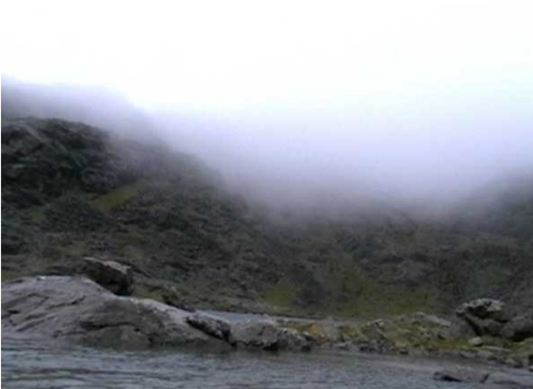
Coir' a' Ghrunnda 360