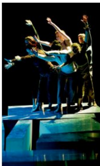
Dancing or dangling: Echo Echo Dance Theatre performing The Cove.