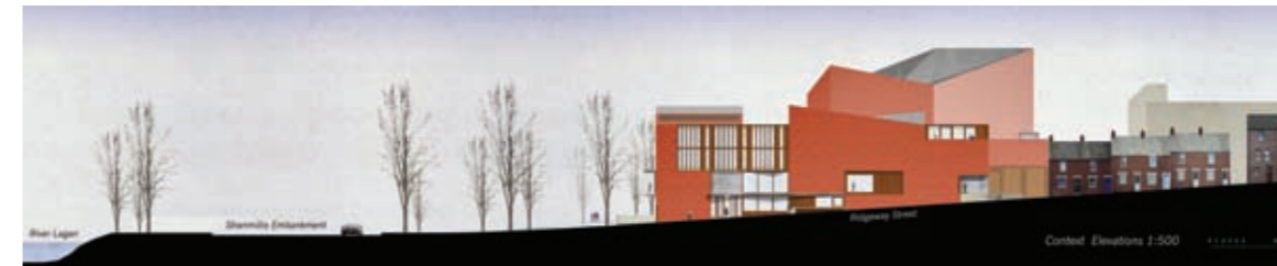
Above / The Lyric Theatre Below/ Broadway, Belfast.

The Belfast@Venice exhibition of 29 A0 panels illustrates the growth and development of the city, including the historical growth pattern and figure ground and also charts recent urban regeneration of the waterfront area and the city centre retail projects. The exhibition also describes in both plan form and 3D emerging urban proposals which will regenerate the former ship building area, the former gasworks, former large industrial sites and several inner urban areas, including Cathedral Quarter and Gaeltacht Quarter, focussed on the use of arts and culture as the generator for urban change.