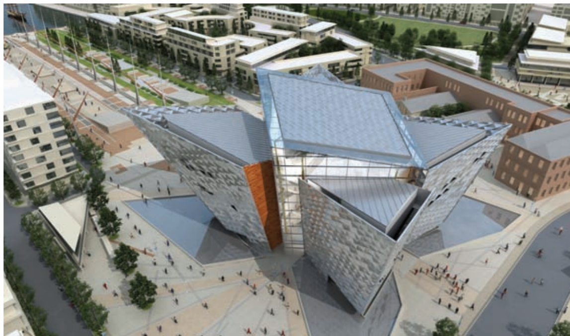
Above / Titanic Signature Building.

Urbanpromo is an annual 4 day conference on urban affairs and regeneration that this year (2010) will coincide with the Venice architectural biennale during October. The conference and series of seminars aims to promote innovation in public-private partnership and to boost investment in cities and infrastructure and to promote exchange and sharing of experiences to develop the knowledge base within cities.