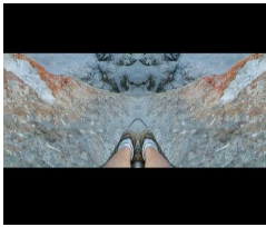
Via Ferrataferatu (Shipsides / SBP) 2010