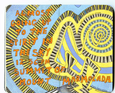
Marmolada Beez 2010 (text and image)