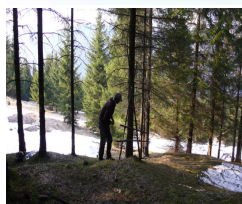
Still not out of the woods 2009