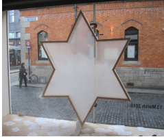
6Star (Shipsides / SBP) 2010