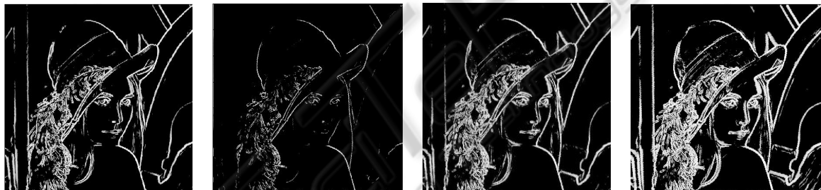
(a) SNN (Wu et al., 2007). (b) 7-Point HSNN (c) 19-Point HSNN (d) 37-Point HSNN