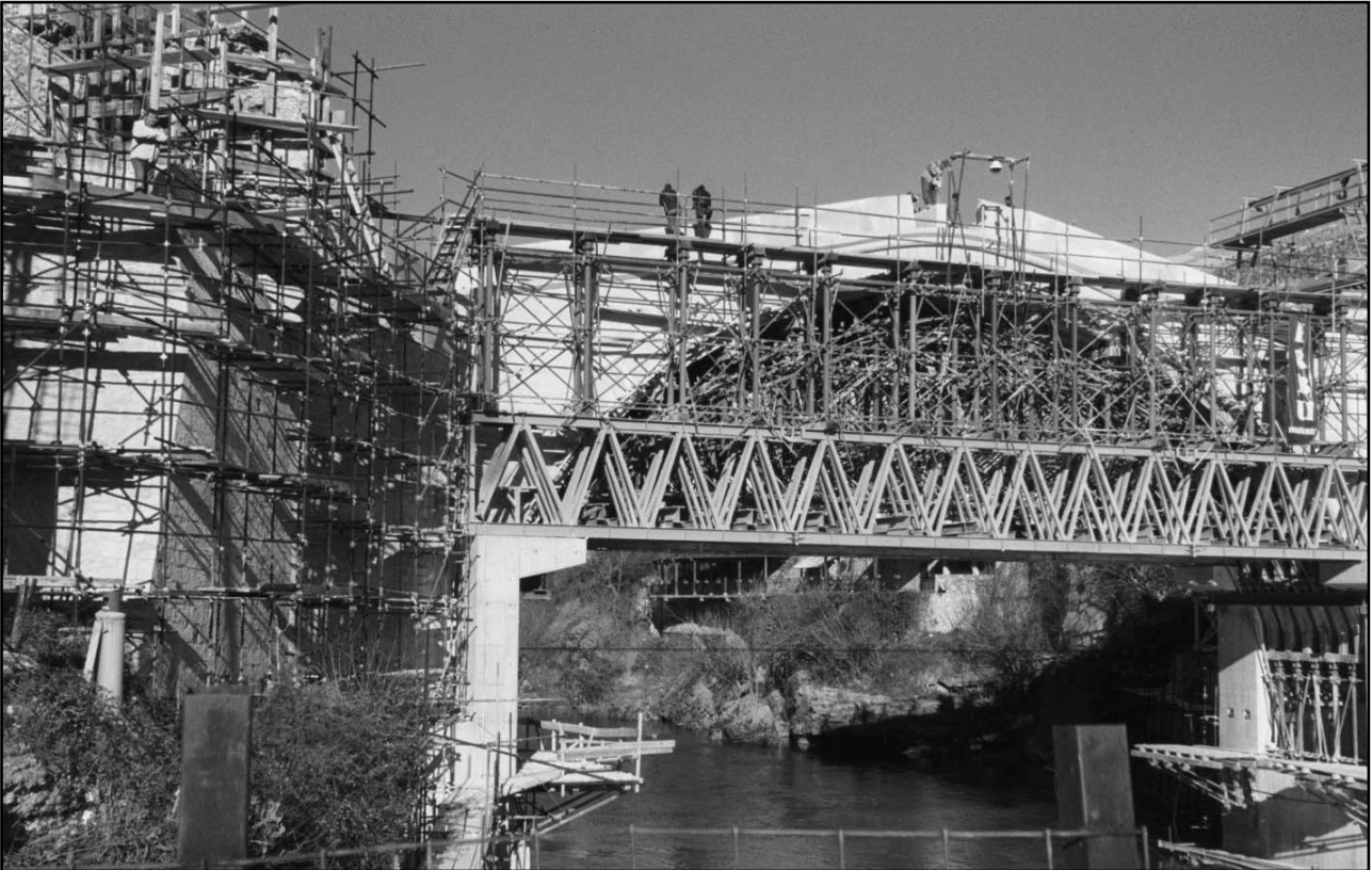
Symbol of reconciliation—but the completion of the bridge at Mostar in Bosnia belies a still sharply divided city