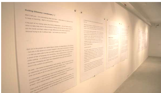
Blind Landscape Texts

Blind Landscape Texts and are a series of wall hung 5 AO texts (18 A0 sheets).