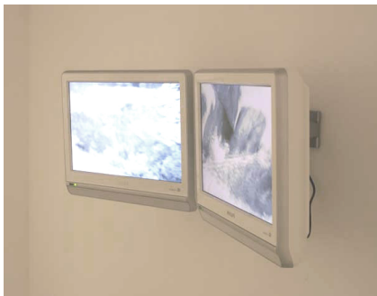
Dolerite, Solarized Pigmatois

Dolerite, Solarized Pigmatois, Two channel DVD 12min.