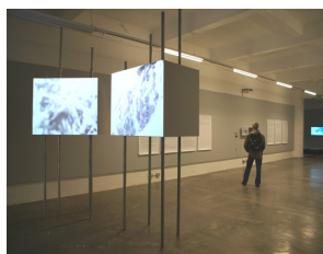
Exhibition at the Gt Gallery ( The Munter Hitch )

Various selected sources are linked below: