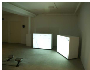
Exhibition at Void gallery ( Echo Valley / A Guiding Dilemma )