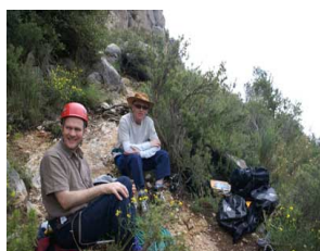
Research information - (archived research as it progressed)