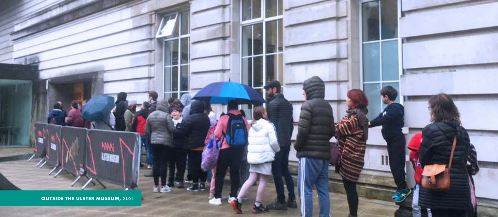
OUTSIDE THE ULSTER MUSEUM, 2021