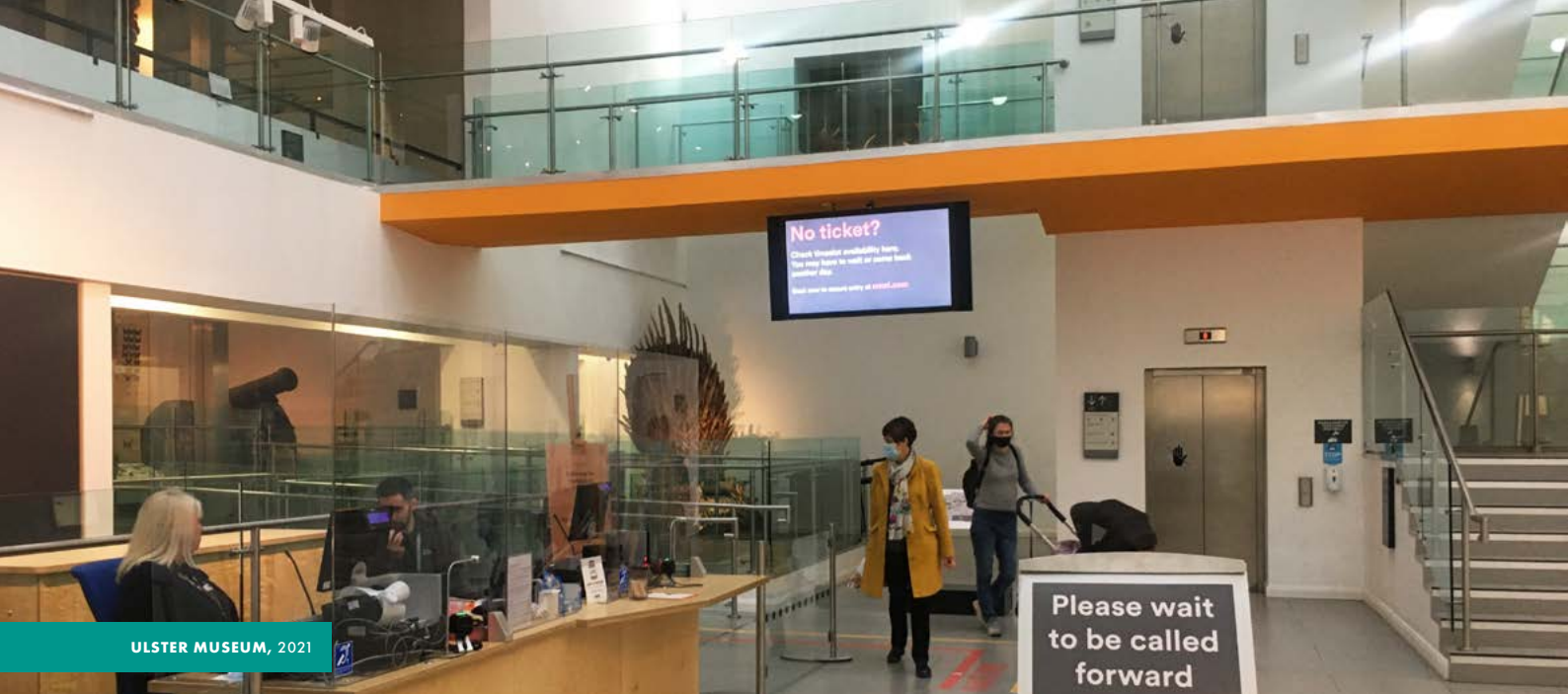
ULSTER MUSEUM, 2021

'Memories, Movement and Museums' has been an important programme for the care home participants. Referring to the sessions with NI War Memorial, the care home co-ordinator described the resources as fantastic. Feedback recorded that the residents were very engaged, stimulated by handling the collections and the contributions of the outreach officer. The co-ordinator in the care home recorded 'strongly agree' for participant's looking forward to each session, talking about the sessions during the week, feeling less isolated, and for the project having a positive impact on their mood; concluding, 'the project was brilliant and the smiles during each session and afterwards proved its success' (Anonymous Feedback, NI Museums Council).