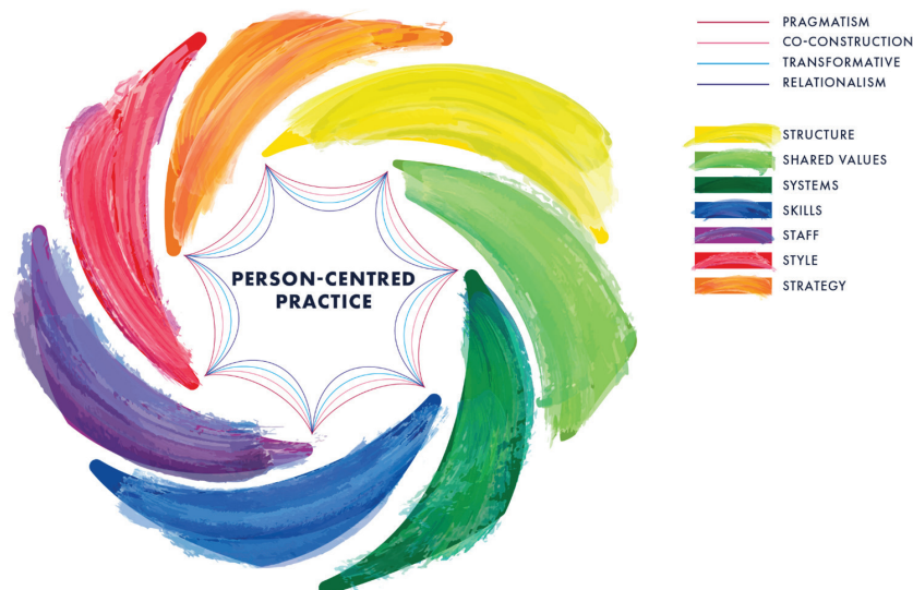
Figure 1: The Person-Centred Curriculum Framework

Figure 1 illustrates how the 7Ss come together synergistically with the philosophical principles of person-centredness (pragmatism, relationism, co-construction, and being transformative (Dickson et al., 2020)) to create healthful, person-centred cultures for education and practice. Ultimately, this results in person-centred practice, brought about by the authentic engagement of stakeholders (educators, practitioners, learners, policy-makers), represented at the centre of the model. The coloured spirals represent each of the 7Ss, and the central spirograph represents how each of the four underpinning philosophical principles work together and are woven through and between the 7Ss. We now present the narrative evidence from our Erasmus+ Project (O'Donnell et al., 2022), brought together using the 7S methodology to create the representation of the PcCF. Each of the 7S components of the Curriculum Framework are described below.