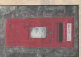
The only wall-type post box in Portrush is on the gatepost at the entrance to the former Strandmore House on Causeway Street. The name POST OFFICE is embossed on the aperture.

Article reproduced with the kind permission of Portrush Heritage Group