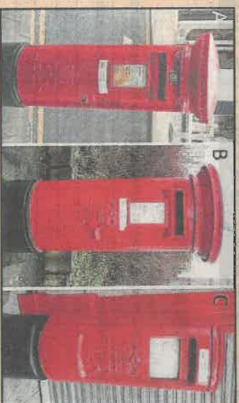
A - the pre-1991 EIIIR pillar-type post box on Main Street, embossed with POST OFFICE. B - the post-1991 EIIIR pillar-type post box at Dhu Varren, Portstewart Road, embossed with ROYAL MAIL. C - the type K box on Dunluce Street.