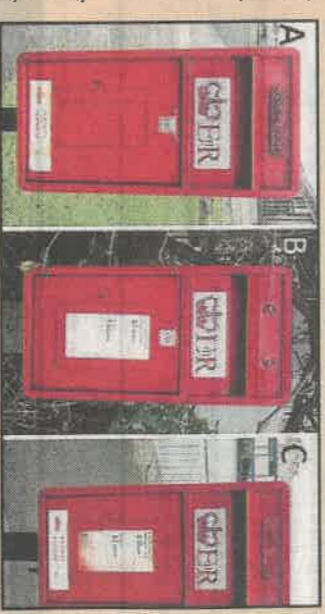
Three lamp-type post boxes: A - Carrick Dhu carraun park, Ballyreagh Road, B - south end of Ballywillan Road, near the cemetery, C - at the Harbour. Each box carries the modern EIIIR cipher. On A and C a detachable metal plate above the aperture states ROYAL MAIL the plate is missing from the box labelled B.