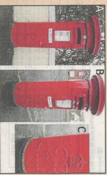
A - the GVIR pillar-type post box on Hopefield Avenue. B - the GVIR pillar-type post box at the north end of Ballywillan Road. C - the GVIR cipher on the Ballywillan Road box.