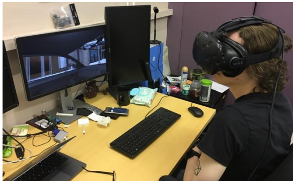
Figure 1. Photo of a user interacting with the VR application.

The VR system was built using the Unity 3D engine. It uses the HTC Vive HMD. The Vive's resolution is 1080 x 1200 pixels per eye, and has a refresh rate of 90Hz.