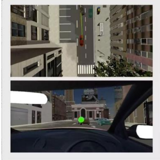
Figure 4. Screenshot of system visualising gaze information

The head tracking data, along with data about the virtual environment as well as the position and rotation of the subject's vehicle in that environment allow us to compute the direction of the subject's head along with information about what is in front of them. Figure 4 shows a top-down (above) and point-of-view (below) heat map of the subject's gaze on the left, and shows information about the observed object(s) on the right, including how long the subject has observed each object in each instance. This screen capture is taken from the "Car reversing from a bay" scenario.