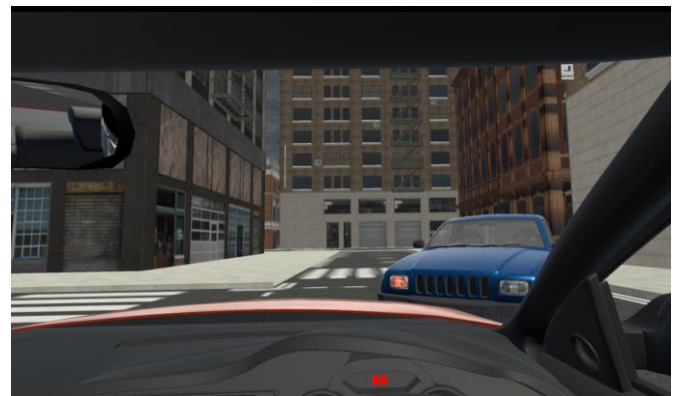
Figure 3. Screenshot of the driver's perspective.

Figure 3 shows a screen from the system during the "Car not stopping at junction" hazard.